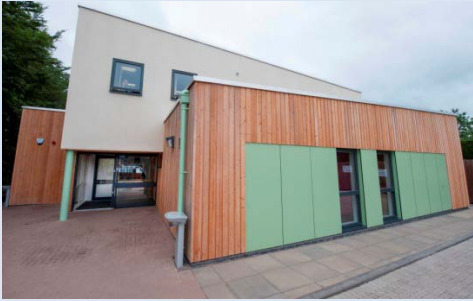
Lauder Health Centre

NHS Borders held an innovative nursing recruitment event . Registered nurses and midwives were invited to attend a one stop shop recruitment day at Borders College. The event proved so successful that it is to become a regular fixture in the HR calendar.