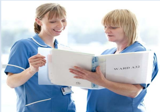
Nurse Recruitment Event

NHS Borders held an innovative nursing recruitment event . Registered nurses and midwives were invited to attend a one stop shop recruitment day at Borders College. The event proved so successful that it is to become a regular fixture in the HR calendar.