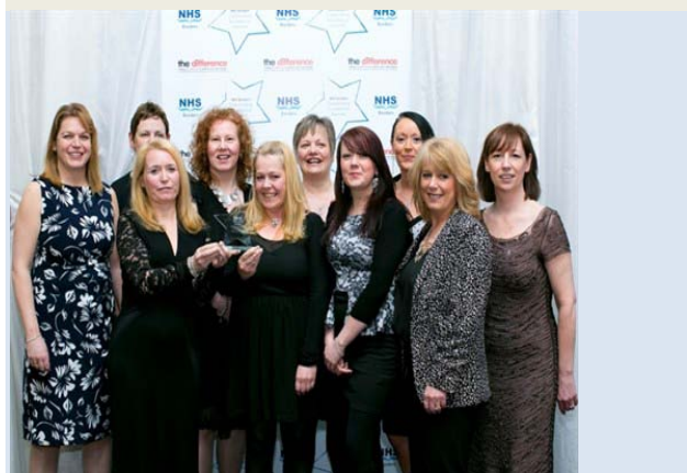
Celebrating Excellence Awards – Special Care Baby Unit Nursing Team

NHS Borders 'Celebrating Excellence' Staff Award nominations were launched, with nine categories reflecting recognition and appreciation for the hard-work, dedication and commitment to providing excellent services demonstrated by our staff, students and volunteers. The very successful first ever 'Celebrating Excellence Awards' Ceremony took place in April 2014 at Springwood Park in Kelso.