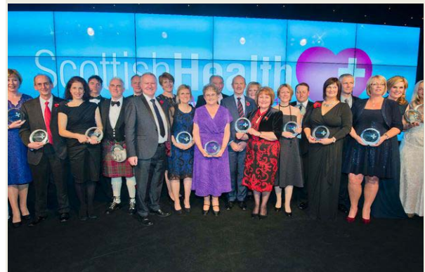
Scottish Health Awards Winners 2013

These awards are dedicated to the extraordinary people on the front line of Scottish health care, and we congratulate all of our nominees, finalists and of course the proud winners!