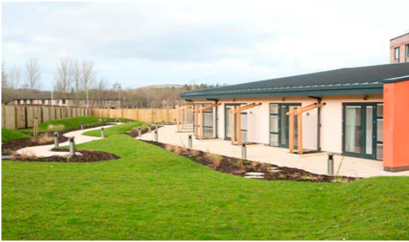
Margaret Kerr Unit