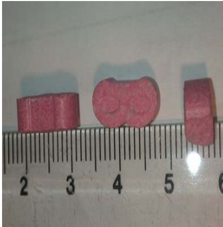
TESLA logo (various colours)