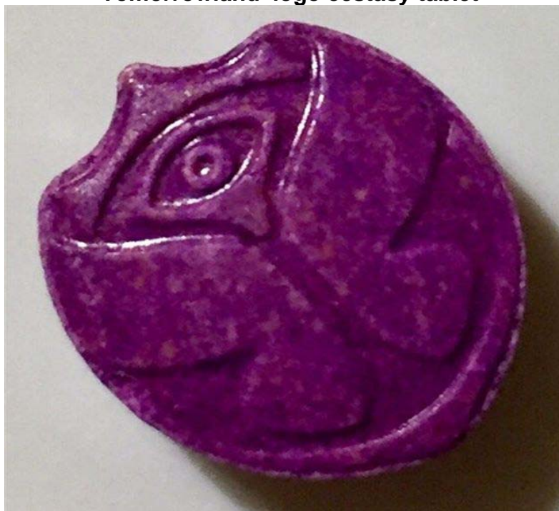
'Tomorrowland' logo ecstasy tablet

Information regarding the strength of the 'Tomorrowland' logo tablet shown in the picture below was circulated on the Internet in October 2016. There are confirmed reports of similar tablets circulating at music festivals in England this year. Forensic analysis reports the tablets may contain large doses (220 mg) of MDMA. There is never any guarantee of tablet content regardless of the logo, shape or colour. This particular tablet reflects the current trend in the ecstasy market of well made tablets in various designs and logos containing a much higher than normal dose of the drug. Higher MDMA content will increase the risks associated with ecstasy use and the consumption of multiple tablets will place a user in serious danger.