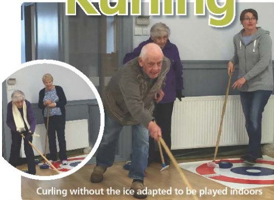
Curling without the ice adapted to be played indoors