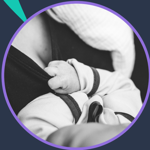
Patient | Maternity Services

The care I received whilst in Ward 17 was exceptional. The midwives, theatre staff and doctors treated me with the upmost respect & made me feel safe at a time when I was feeling extremely vulnerable.