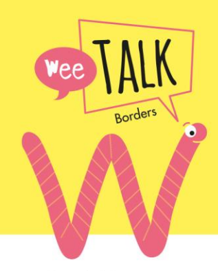
Speech & language therapy